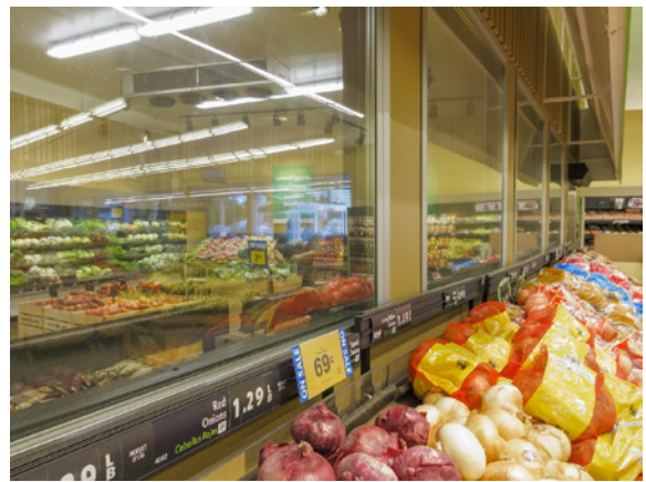
Custom sizes available