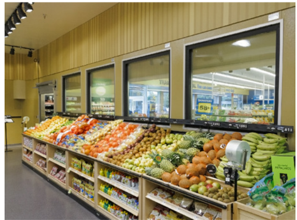
Optional & elegant interior trim frame kit