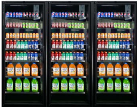
STYLELINE® RM Shown