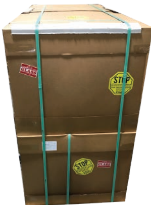
Double Stack Door Packaging (Up to 10 doors)