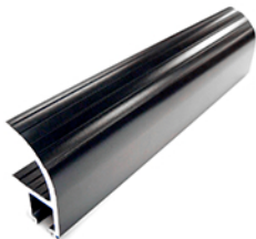
Full length Handle