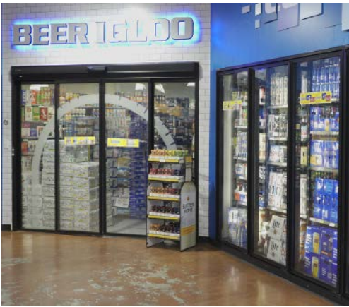
108" Automatic Beer Cave