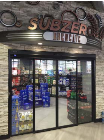
108" Automatic Beer Cave