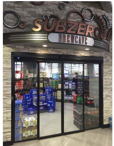
108" Automatic Beer Cave

STYLELINE ® Automatic Beer Cave Doors are completely automated offering hands-free convenience and outstanding ways to invite customers in!