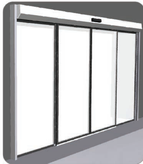
120" Automatic Beer Cave