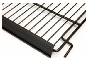
Flat Shelving Profile