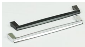
Standard Handle Finishes