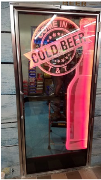
* Shown with optional custom illuminated glass