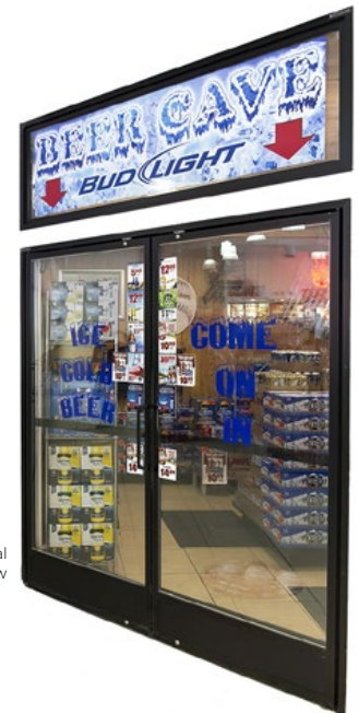
Shown with optional Fixed Window