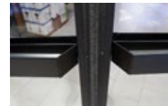
Standard Push Bar