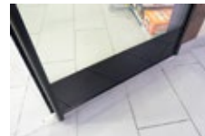
Front Silk Screen