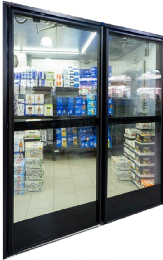
Two-door French Model Shown