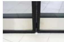
Stainless Kick Plate