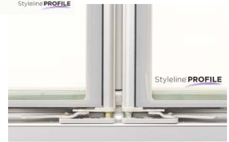
Bottom Door Hinge