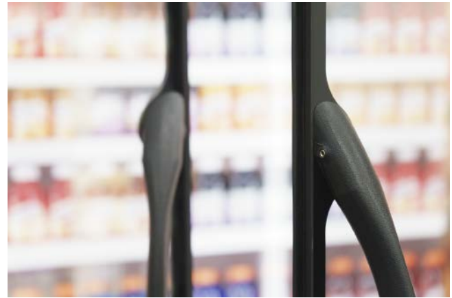
Elegant design door handle