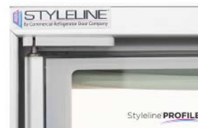
Top Door Hinge