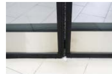
Stainless Kick Plate