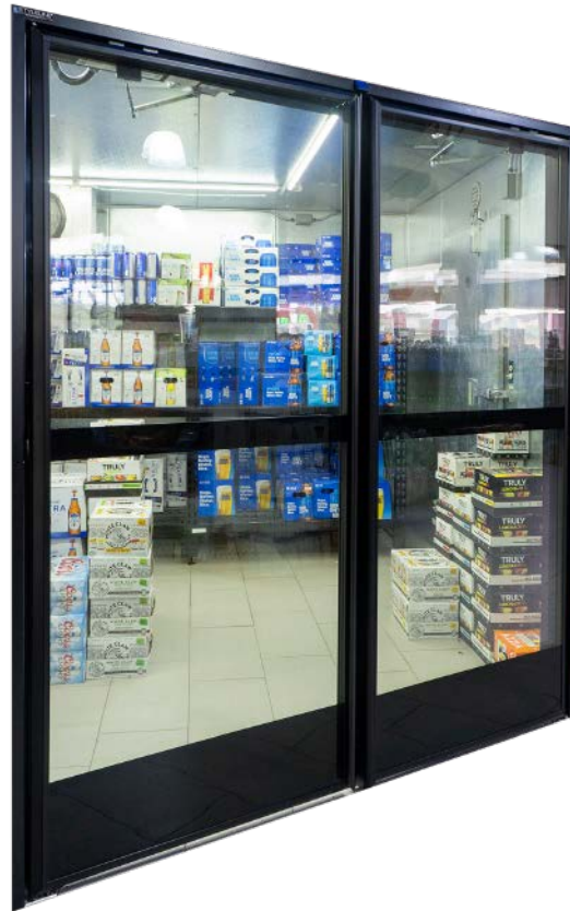
Two-door French Model Shown