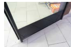
Front Silk Screen