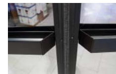
Standard Push Bar