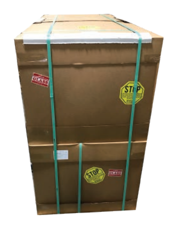
Double Stack Door Packaging (Up to 10 doors)