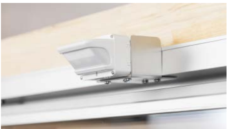
Ambient Sensors & LED Motion Sensor Installed