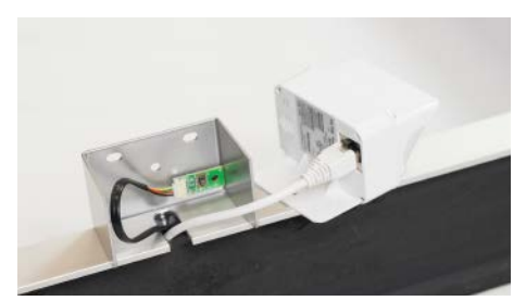
LED Motion Sensor & Ambient Sensor Connected