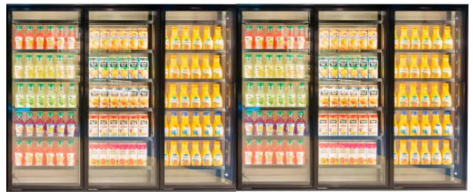
STYLELINE® CL Shown