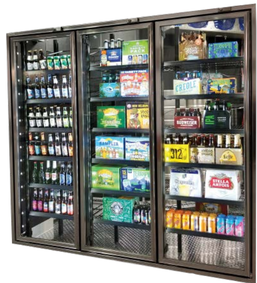
STYLELINE® CLNT shown

Fully compliant DOE 2017 product portfolio performance levels are exhibiting the highest levels of performance and condensation protection in the industry.