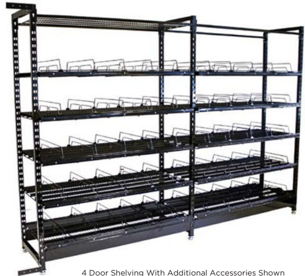
4 Door Shelving With Additional Accessories Shown