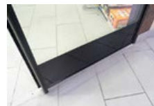
Front Silk Screen