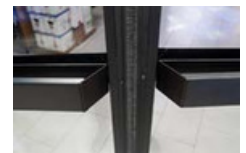
Standard Push Bar