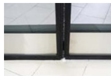
Stainless Kick Plate