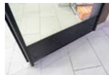
Front Silk Screen