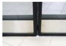
Stainless Kick Plate