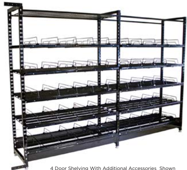
4 Door Shelving With Additional Accessories Shown