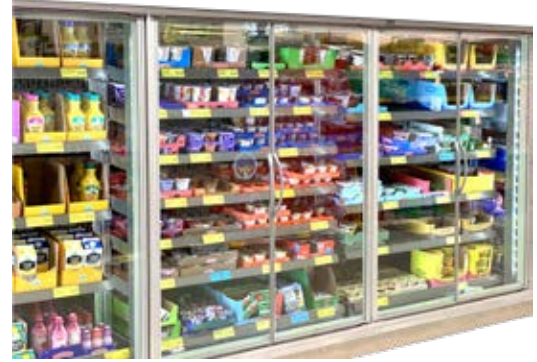
French Hinged Style Shown