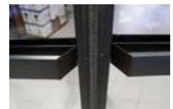
Standard Push Bar